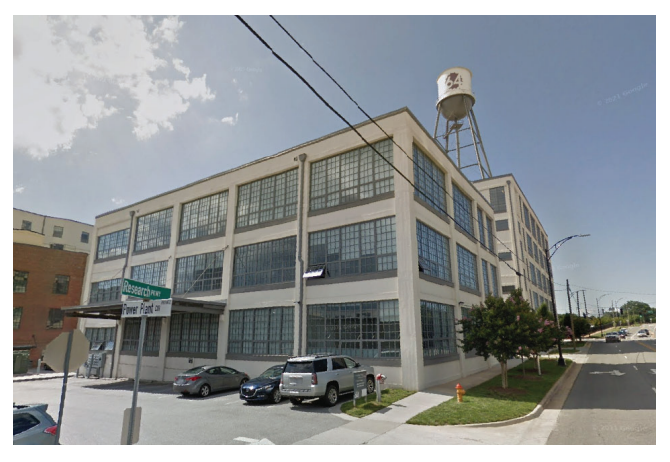
High-Density Multifamily Residential