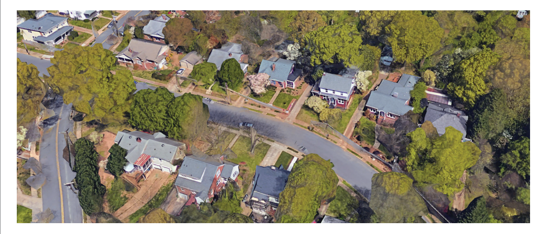
Single Family Residential (detached)