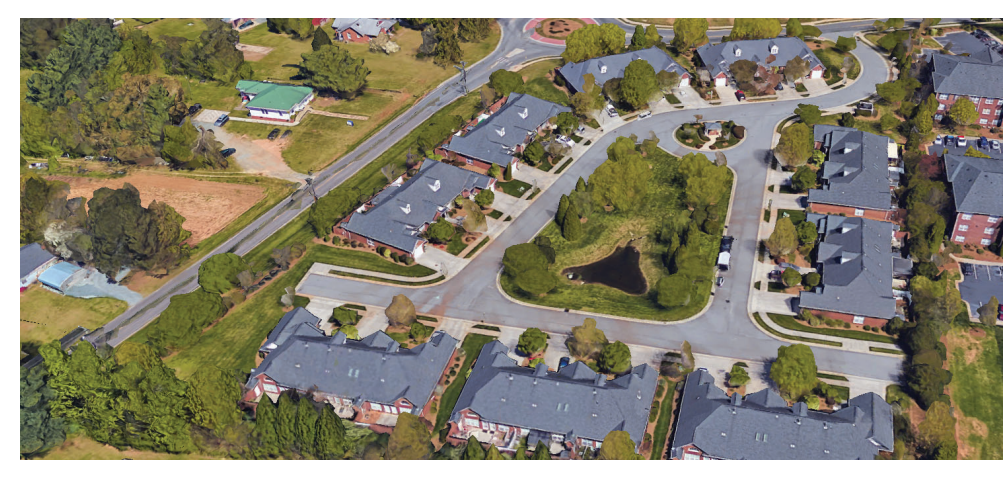
Twin Home / Townhouse